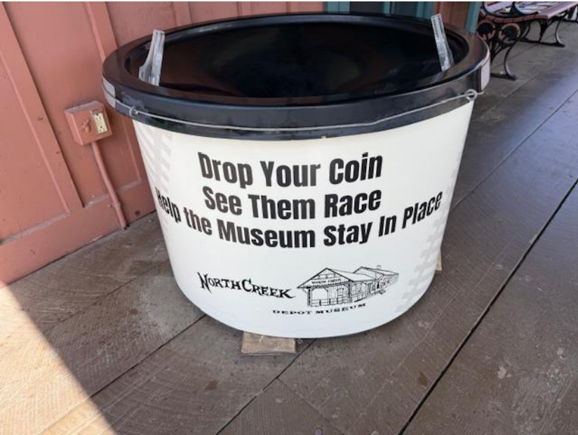
Renewed Coin Drop

If you’ve stopped by the Museum recently, you will have noticed our newly refurbished coin drum near the entrance. The drum, also known as a hyperbolic funnel, has been attracting both attention and spare change.